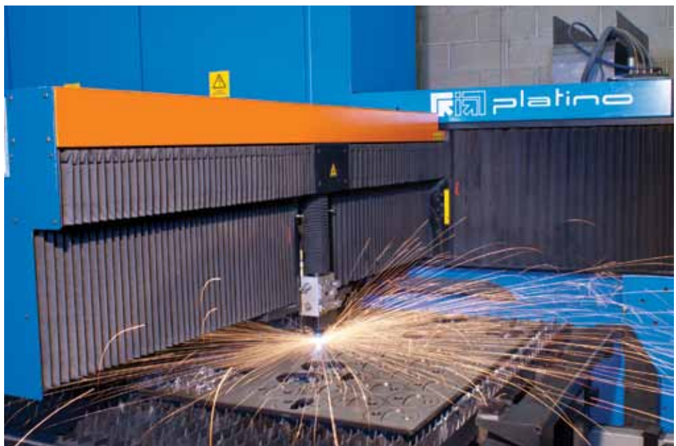
A second view of a Platino at work.

“The Platino lasers have helped us expand our business,” says Williams. “They have great dust collection systems that allow us to cut things we haven’t cut before because of the fumes. We have one plastic job that used to take about 20 hours on our old laser, that now takes eight hours on the Platino with the automated load/unload.”