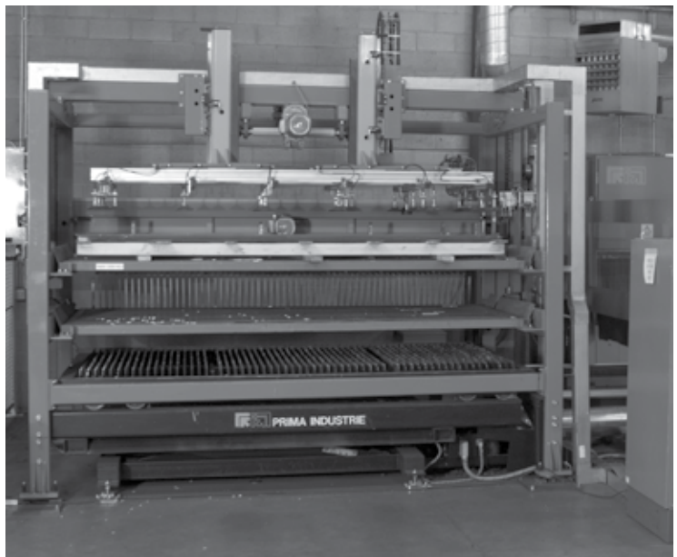
Precision Laser Processing bought its second Platino with a compact server.

competitive because we are making parts lights out. We've gone from three shifts to two shifts. And we often run parts on the weekend. This has raised our productivity. We had 21 employees, we now have 11, and we are making more parts with the two Platino lasers with loaders than we did with five stand alone lasers." ■