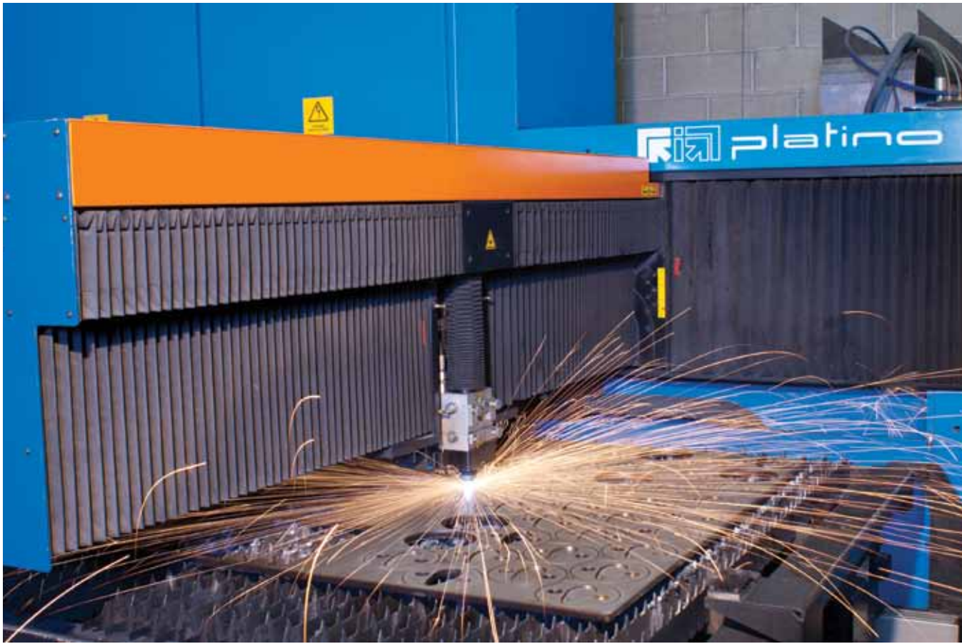
The Platino cuts a broad range of materials and thicknesses with speed and precision without the need for manual adjustment. Platino's laser cutting head gives users a choice of a 10-inch focal length in addition to the standard 5-inch and 7.5-inch lenses.