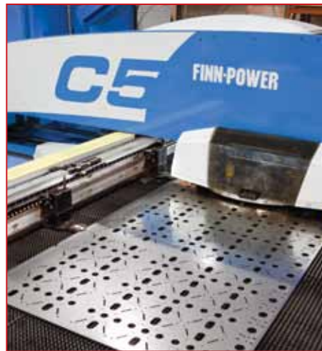
D & R Electronics has used the Finn-Power C5 Compact Express turret punch shown here as a stepping stone into automation.

The C5 Express adds unmanned operation to the C5 turret punch press through highly compact load/unload automation. The unit’s loading /unloading solution utilizes the space above and below the machine, requiring only slightly more space than a turret punch press. It is fast, with simultaneous loading and unloading during processing, accurate, and it does not limit easy manual operation. The 20-station, 33-ton C5 hydraulic turret