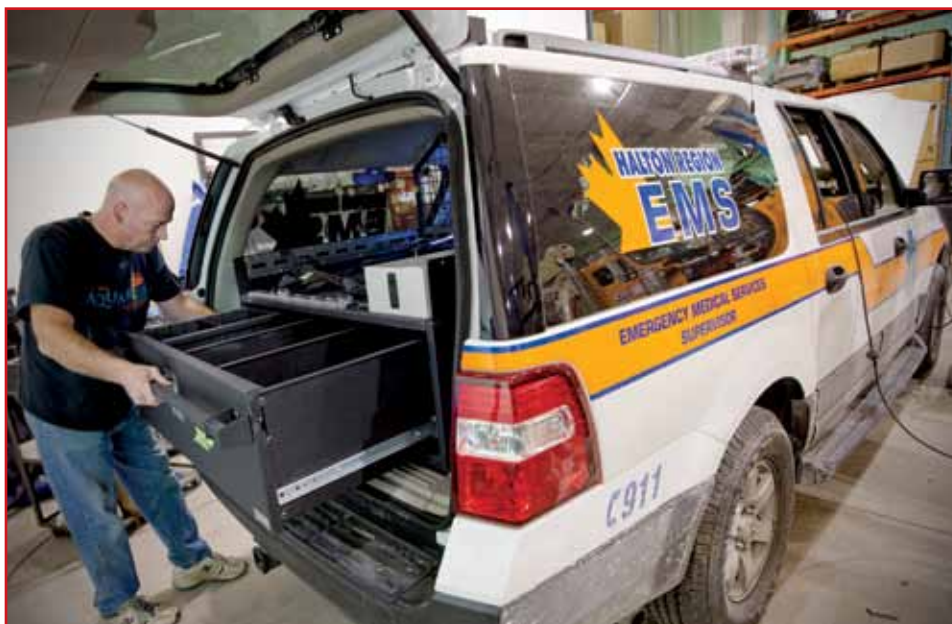
D & R Electronics designs and manufactures a wide range of light and sound control systems, cabinets, chassis, and other equipment for police, fire, utility, and emergency vehicles.

Offering a compact footprint along with a Cartesian, Cantilever structure that provides three-sided access, Platino is a cost-effective machine that is easy to operate and quick to program. Its unique stonecast frame reduces vibration and increases stiffness by about 4 times compared to cast iron and about 6 times compared to welded frames. Its low heat conductivity results in much higher thermal stability compared to traditional cast or steel frames.